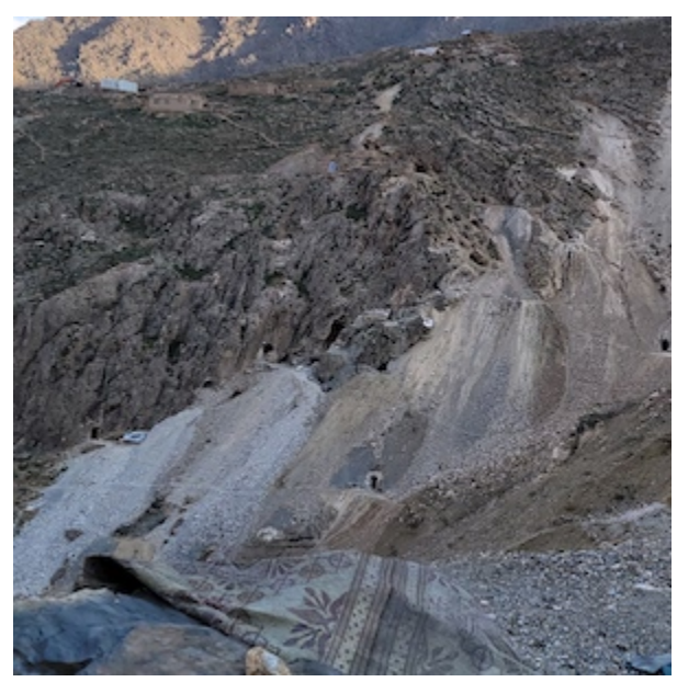
An emerald mine in Khenj, a district in Panjshir Province

Like most of Afghanistan's gem sector, the country's emerald mines are mostly small-scale, with diggers using primitive tools, and they sell their gems outside of official channels.